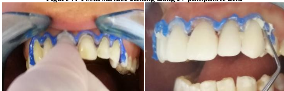
Figure 10: veneers luting and excess removal

The bonding agent was then scrubbed on each tooth surface and air spread in order to obtain a thin layer and to guarantee a right positioning of the ceramic veneers. The bonding agent was then light cured for 20 seconds. A thin layer of light curing resin luting cement (NX3 Nexus™, Kerr®) was applied on the inner surface of each veneer separately and was carefully placed with the thumb and forefinger, from incisal to cervical starting with the two central incisors, then the two lateral incisors and finally the canines.