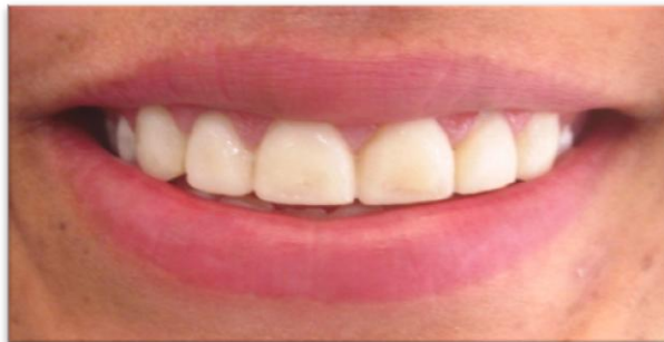
Figure 6: The patient's smile with provisional restorations

After teeth preparation was completed, gingival retraction was done using a gingival cord (C-00 Elsocord, Elsodent®), then the master impression was made using polyvinyl siloxane material (Elite HD+, Zhermack®). Provisional veneers were corresponding to the wax up previously done (Fig6). They were fixed to the teeth using undercuts.