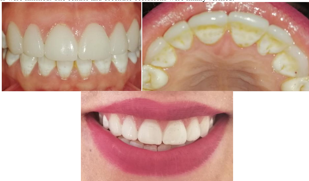
Figure 11: Post treatment views

Once the restoration surely seated, initial light curing was performed during 5 seconds followed by excess cement removal (Fig10). The light polymerization was completed on the palatal, labial and incisal sides and the margins were finished. The centric and eccentric occlusions were finally verified.