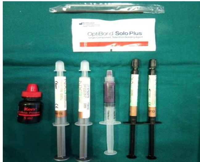
Figure 8: Bonding material (NX3 Nexus™, Kerr®)

In the next session, the porcelain veneers were tried and checked firstly on the master cast. After tooth surfaces were cleaned up, the correct fit of the veneers was verified individually and collectively using the try-in paste: the adaptation and margin were critically evaluated. No rectification was necessary because of the perfect fit of the veneers. Once the fit and shade results were satisfactory for the clinician and the patient, final adhesive seating could be performed completely predictably. The cores were cleaned again with water spray and then the veneers were luted.