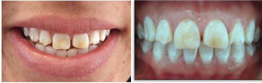
Figure1: Pretreatment intraoral and extraoral views

The first phase after oral prophylaxis included smile analysis and shade selection. Study cast and photographs were done and a detailed smile analysis was performed using “Digital smile design” (DSD) (fig2). Diagnosis wax up was done and showed to the patient (Fig3). The mock-up has helped her to understand what was offered to her, and she confronted it with what she was expecting (12). At the same time, we could control the function, occlusion, the posture of the lip, the smile line, and the phonetics (11). (fig4)