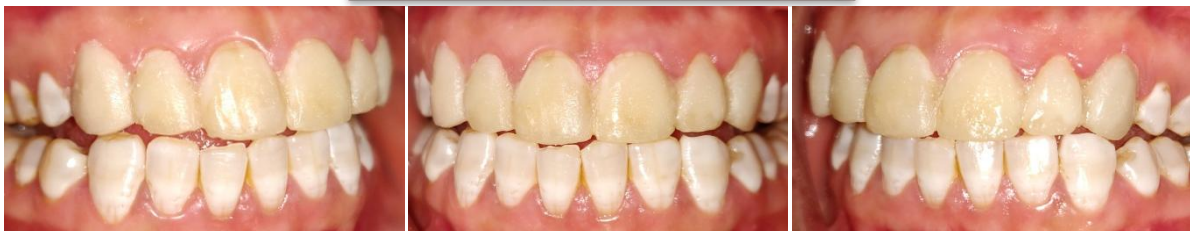
Figure4: intraoral views with the mock-up

Once the patient was satisfied, tooth preparation was initiated. After anesthetizing the planned teeth depth grooves were placed on the labial surface using depth burs over the mock up to achieve a minimal invasion of the teeth. The guidance grooves were done at 0.3 to 0.5 mm depth. The mock-up remnants were then removed and we continued the preparation which was oriented by the deepness of the grooves using a