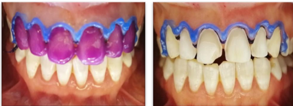
Figure 9: Tooth surface etching using 37 phosphoric acid

Gingival protection was then initiated using a gingival retraction cord and a light curing dam. Each tooth surface was etched with 37% orthophosphoric acid for 15 seconds then rinsed and gently dried (Fig9).