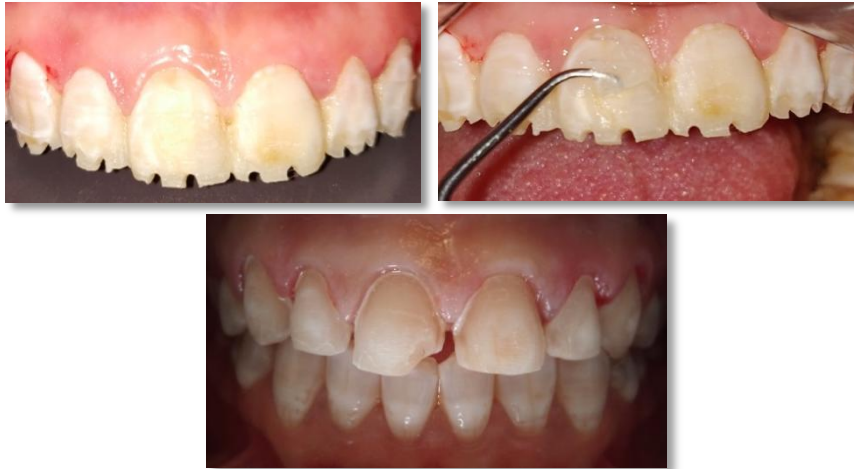
Figure5: tooth preparations

chamfer diamond point (12). The preparation was extended on the intrasulphral proximal surfaces in order to close the diastema and 1.5 mm incisal reduction was made (Fig5).It also involved the elimination of an old resin restoration on the buccal surface of the tooth#11.