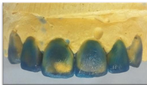
Figure3: Waxed diagnosis cast